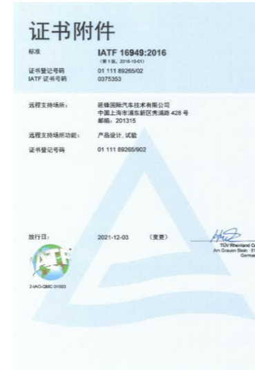
IATF 16949: 2016 汽车质量管理体系