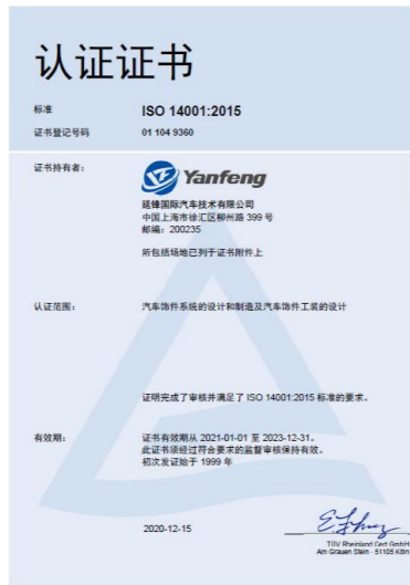
ISO 14001:2015 环境管理体系证书